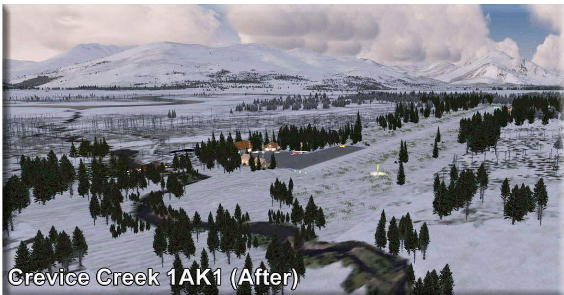
Crevice Creek 1AK1 (After)

Notice the creeks are now added, flowing to the John River. Also vegetative landscaping enhances the location.