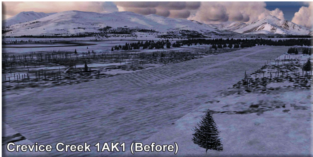
Crevice Creek 1AK1 (Before)

This was an interesting airport to “update” for RTMM. This is what we started with: